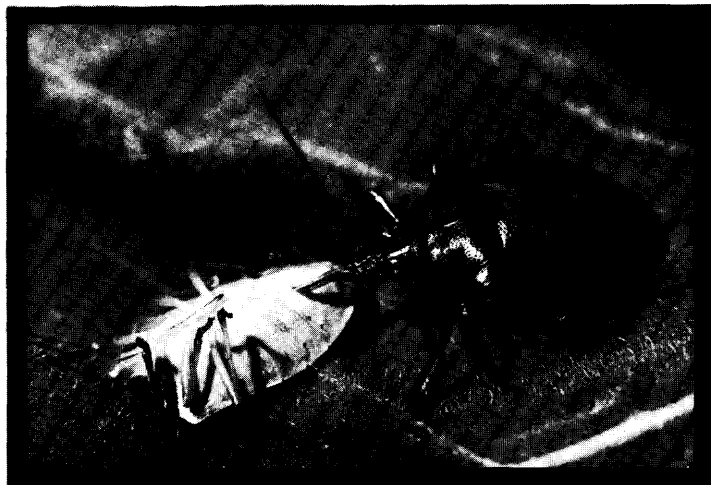
Fig. 1. Euthyrhynchus floridanus (L.)♀ preying upon adult southern green stink bug, Nezara viridula (L.). This specimen of E. floridanus has the 2 anterior scutellar spots expanded and coalesced into 1 large spot.

INTRODUCTION: The predatory stink bug, Euthyrhynchus floridanus (L.), is considered a beneficial insect because most of its prey consists of plant damaging bugs, beetles, and caterpillars. This stink bug is primarily a Neotropical species that ranges into southeastern quarter of the United States. It seldom plays more than a minor role in the natural control of insects in Florida, but its prey includes such economic species as southern green stink bug, Nezara viridula (Linnaeus) (fig. 1), orangedog, Papilio cresphontes Cramer, and West Indian sugarcane rootstalk borer, Diaprepes abbreviatus (Linnaeus) (fig. 6).