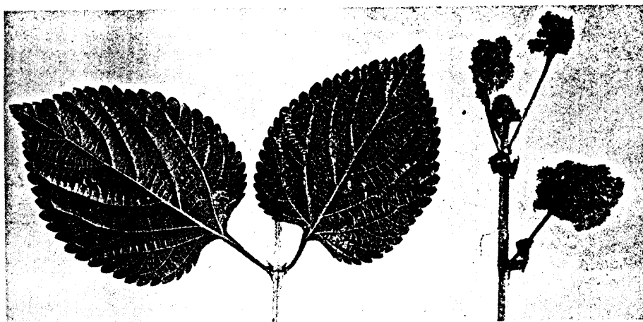
FIG. 1. NORMAL LEAVES AND FLOWER GALLS OF LANTANA CAMARA L. INFESTED BY ERIOPHYES LANTANAE .

CONTROLS: SINCE THIS MITE APPEARS TO BE ASSOCIATED ONLY ON LANTANA SPP., WHICH ARE CONSIDERED PESTS IN MOST INSTANCES, NO CONTROLS HAVE BEEN RECOMMENDED. IF THE PLANT IS BEING USED AS AN ORNAMENTAL, KELTHANE PROBABLY WILL GIVE ADEQUATE CONTROL.