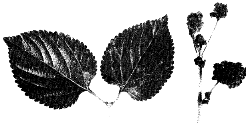
Fig. 1 Normal leaves and flower galls of Lantana camara L. infested by Aceria lantanae (Cook)

Cook, Melville Thurston. 1909. Some insect galls of Cuba. Cuba, Sec. Agr., Com. & Trabl., Est. Cent. Agr., 2 Report (1905-1909) Pt. II: 143-146.