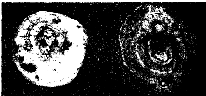
Fig. 2. Corm on right showing advanced stage of injury.