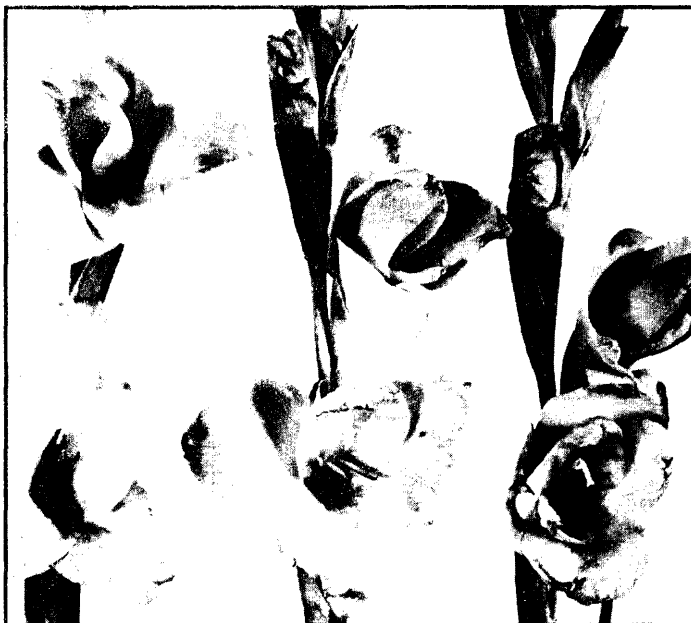
Fig. 1. Florets on right showing thrips damage.

DISTRIBUTION —Gladiolus thrips is widespread and is found where gladiolus are grown in Africa, Asia, Australia, the Pacific Islands, Europe, and North and South America. It is found in almost all states of the United States. Although it cannot overwinter out-of-doors in northern Europe and northern North America, the spread of this thrips probably results from its infested corms being shipped to all parts of the country. It was first found in Florida in 1932 (Watson, 1941).